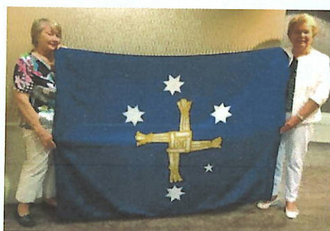
Photo of St Brigid's Flag

Sadly, the 2022 Dinner was cancelled owing to the impact of Covid-19 in December 2021 which carried over into 2022.