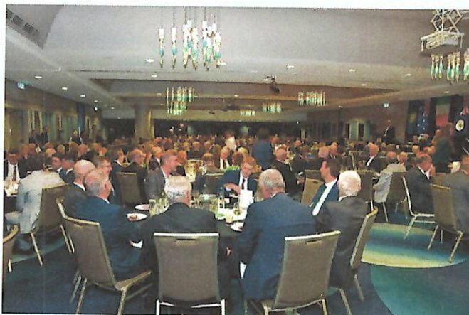
Guests enjoying a memorable night