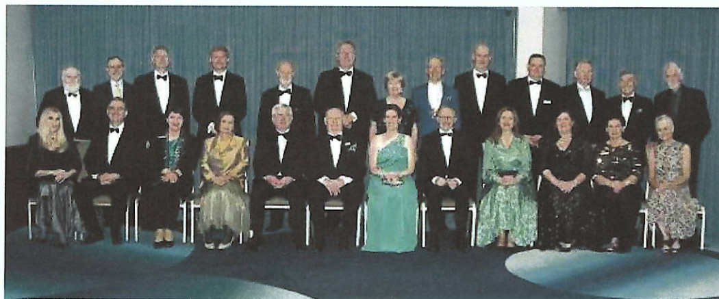
Official Party - St Patrick's Eve Dinner 2022