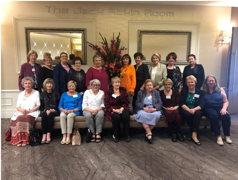
At Easts Leagues Club