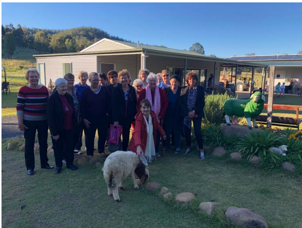
Awassi Day Trip 2021