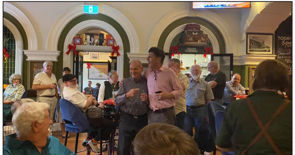
Our Members were in fine voice at our December drinks meet-up at the Grand Central Hotel, singing and clapping along to festive tunes by QIA Pipe Band. And there was even a surprise appearance from Santa and Mrs Claus.