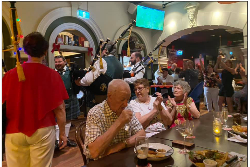
The craic was mighty as members of Queensland Irish Association Pipe Band played seasonal tunes at our December drinks meet-up at Grand Central Hotel. More photos of the evening are on page 2.

Comhaltas advises: "In case you're unsure who Edward Bunting is, he was a historical musical figure born in Co. Armagh, Northern Ireland, and began