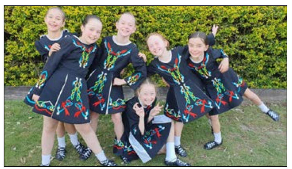
The future is bright for QIA Dancers. Mid Year Feis 2021 marked the very first ceili competition for these six dancers. They took home a 2nd place, 3rd place and Highly Commended prizes for their efforts. Well done.

QIA merchandise will be available for sale, including historic "Centenary" QIA ties.