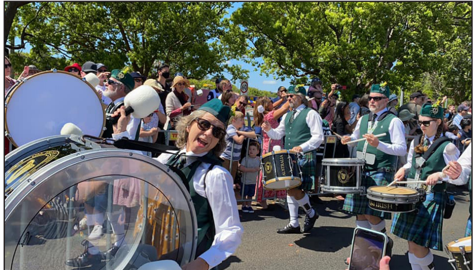
The Queensland Irish Association Pipe Band in action at the Toowoomba Carnival of Flowers. More photos on page 2.

It is important that you indicate your intention to attend the October drinks by sending an email to irisheventsbn@hotmail.com