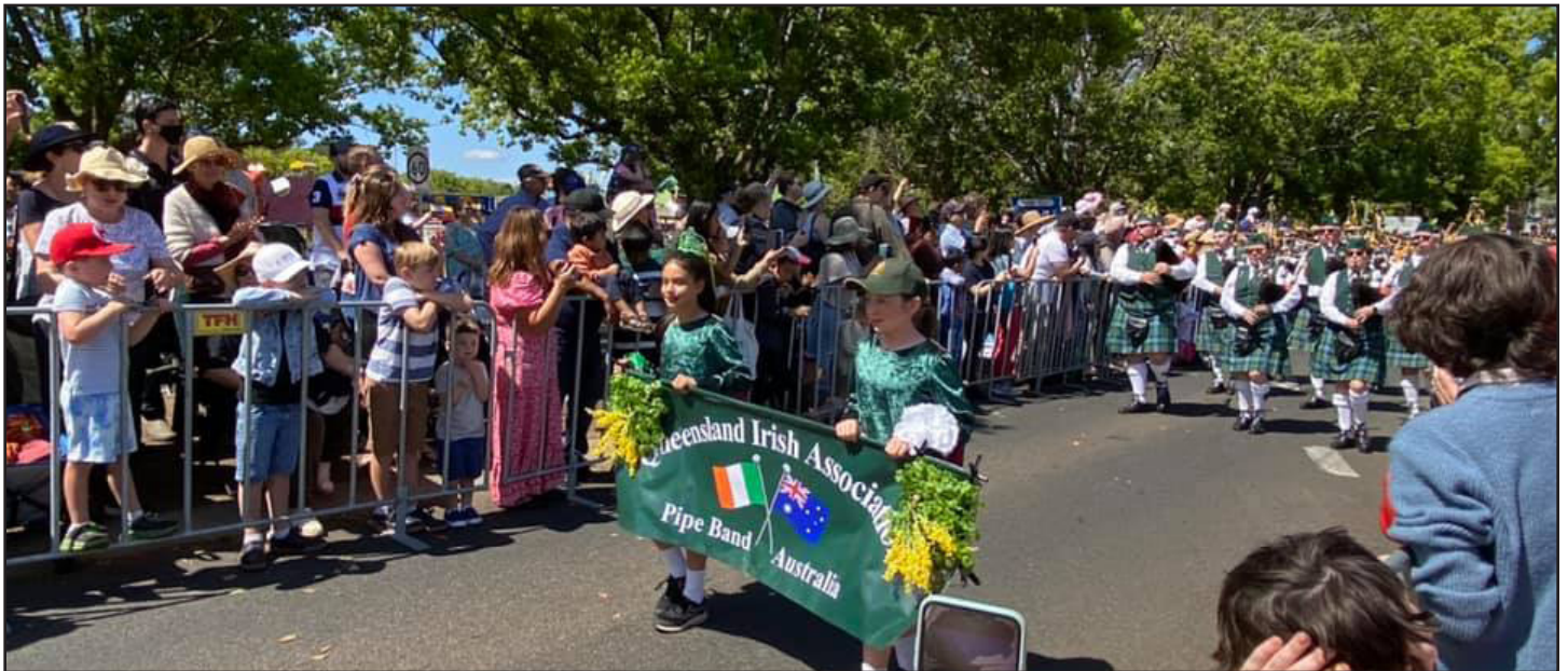
Queensland Irish Association Pipe Band and the Irish float at Toowoomba Carnival of Flowers.

Keepers of the Flame will be shown at Elizabeth Street Theatre on Saturday, 6th November.