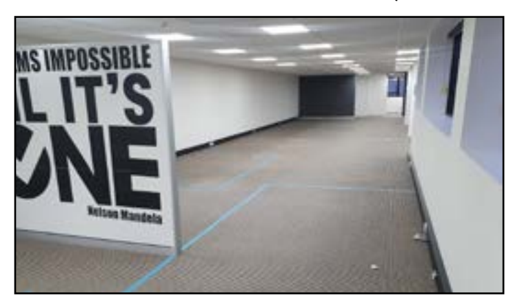
From the front of the building, looking towards the back.