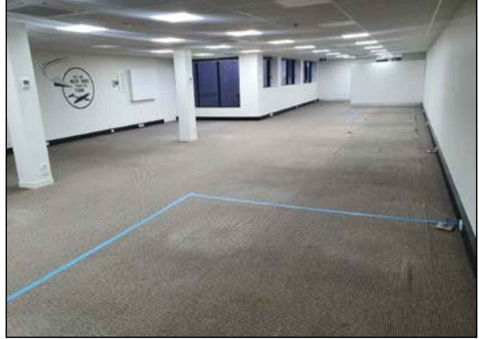
From the back looking towards the front of the building, pictures above and below.

You can hear the interview by going to our website (<a href="www.queenslandir-ish.com">www.queenslandir-ish.com</a>) or on our Facebook page, <a href="www.facebook.com/Qldirishclub">www.facebook.com/Qldirishclub</a>, where you'll find the story from the 2:18:00 mark.