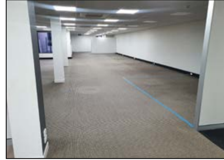
Kitchen area looking towards the front of the building, above left, and, right, view from the back to the front of the building.