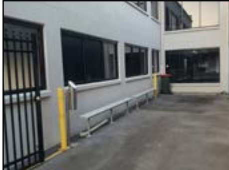
A very usable outside space at the side of the building.